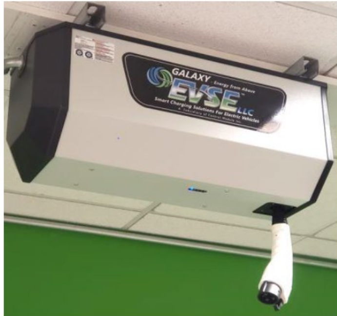
Example Overhead Level 2 EV Charger