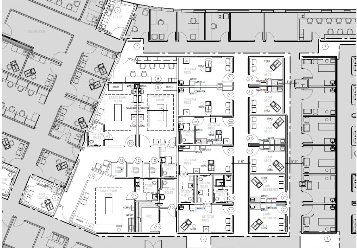
Conceptual Floor Plan